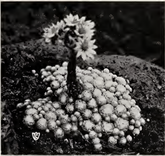
SEMPERVIVUM, OR LIVE-FOR-EVER

SEMPERVIVUM, or LIVE-FOR-EVER —These very robust easily grown rock-plants are a joy to watch growing over almost bare rocks, especially the cobwebby sorts which have a net of spiderweb-like hairs growing over the crowns giving them a whitish-grey appearance of great beauty. We are growing over 60 sorts in our collection, priced from 10c to 25c per clump.